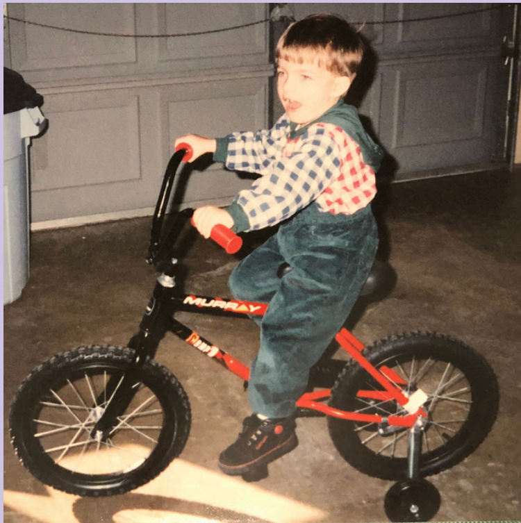
Happy, Young Cyclist!