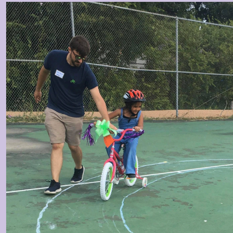
AAMPO Transportation Planner