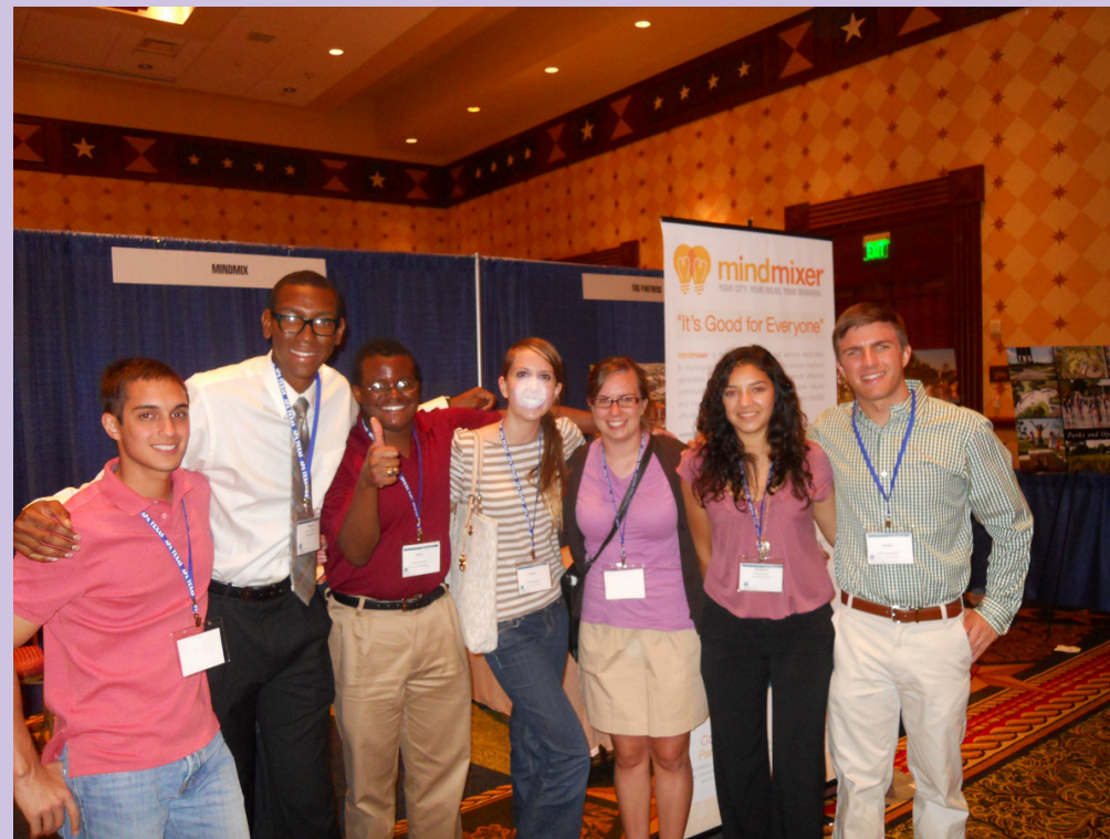
TAMU BS Sociology / Urban Planning