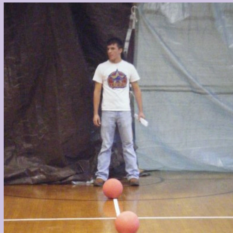
High School Organizer