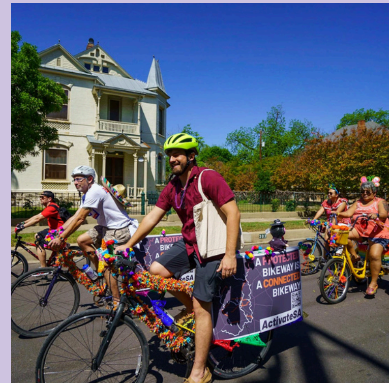
ActivateSA founding member