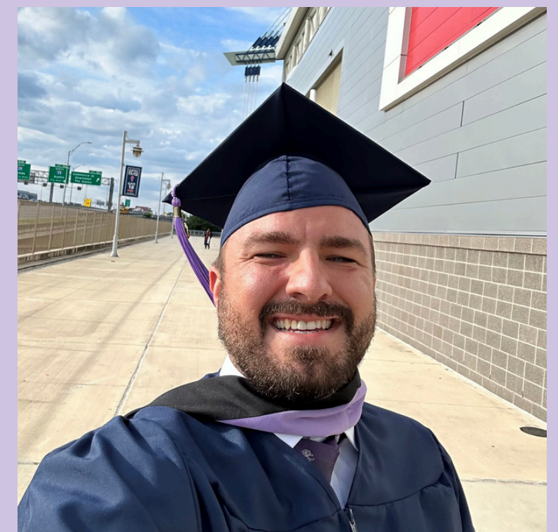
UTSA MS Urban Planning