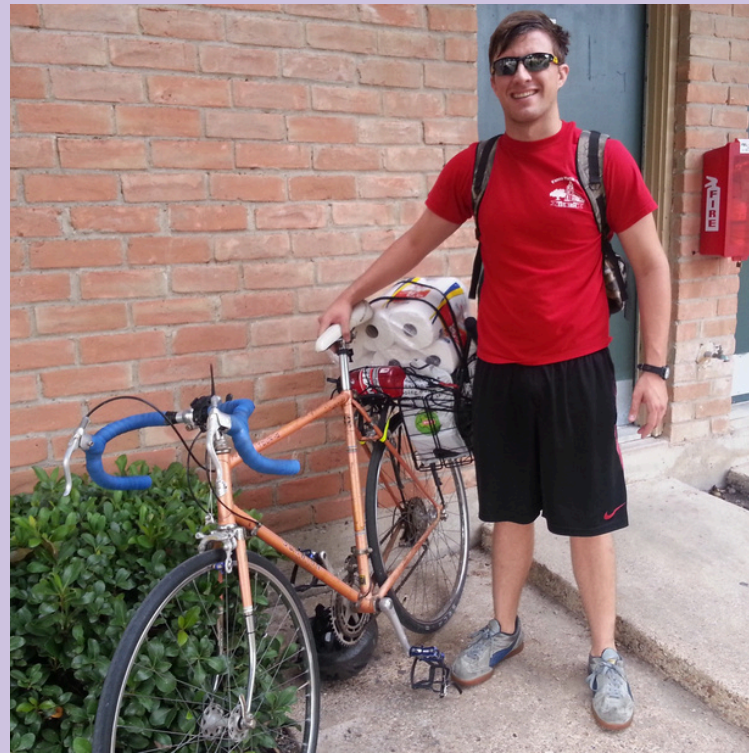
Bike Commuter & Mechanic