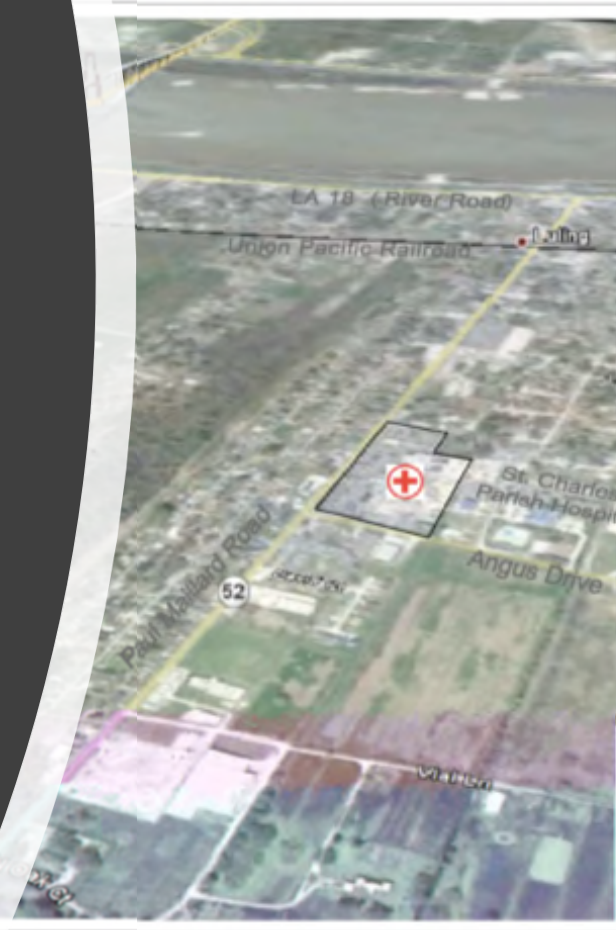
LA 52 Widening Study includes Pedestrian access improvements